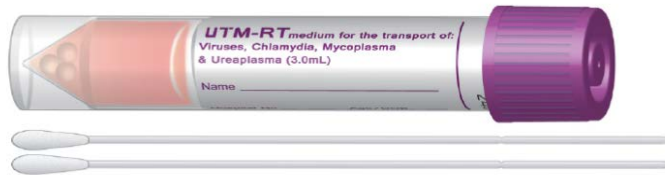
Universal Transport Media (UTM)